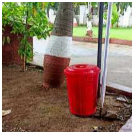
Fig. Type of Dustbins used