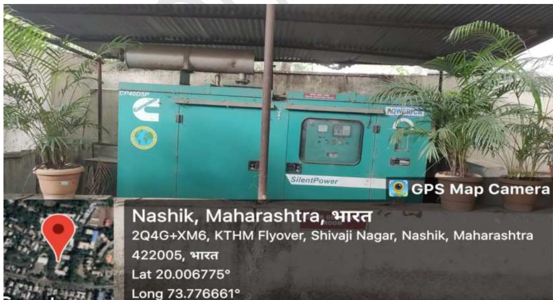
Kirloskar Diesel Generator (32 kVA)

HSD is used as a backup power supply for Diesel Generator which run whenever power supply from MSEDCL is not available.